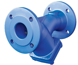
AT 4028B, AT 4029B

The differential outlets are located on the top.