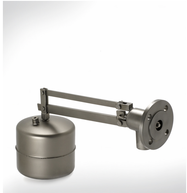
illustration shows NV 98FP

Operating instructions, know how and safety instructions must be observed. The pressure has always been indicated as overpressure. We reserve the right to alter technical specifications without notice.